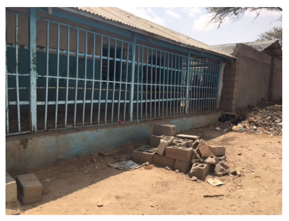
Fig. 1 Entrance to Mental Health Department, Hargeisa Group Hospital, Hargeisa, Somaliland.